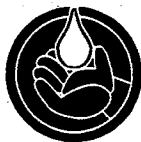
EXHIBIT 3-B, Attachment 2