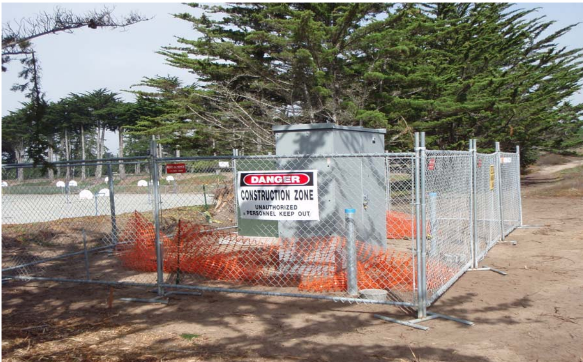
Figure 4. Electrical transformer and motor control, Seaside Middle School, November 2011.