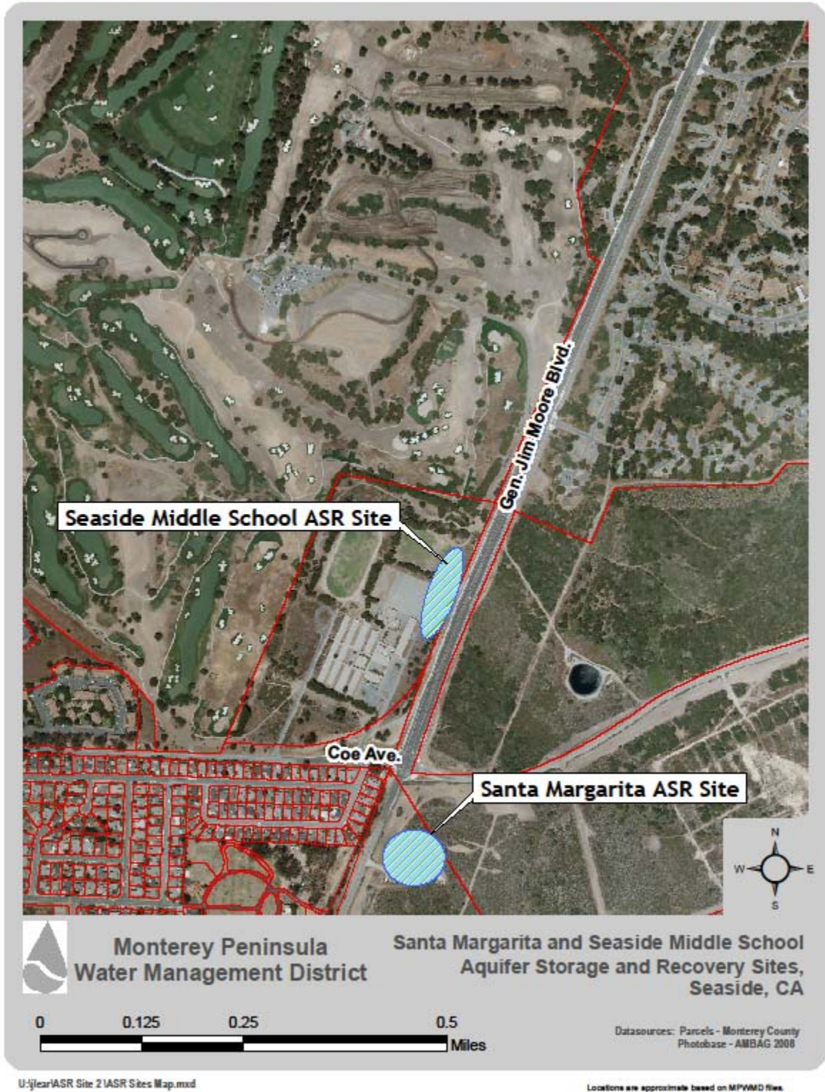
Figure 1. Vicinity map showing Santa Margarita and Seaside Middle School Aquifer Storage and Recovery sites.