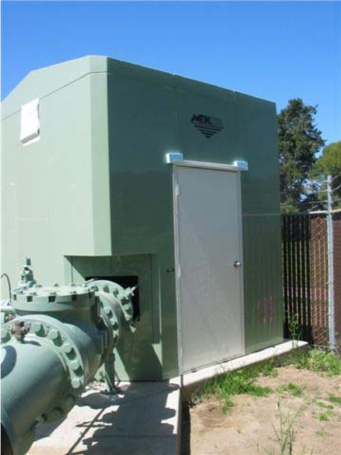
Figure 9. Typical sound-proof well enclosure.