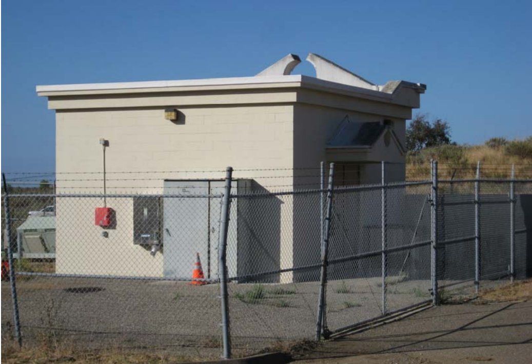
Figure 6. Typical well control building for ASR facility.