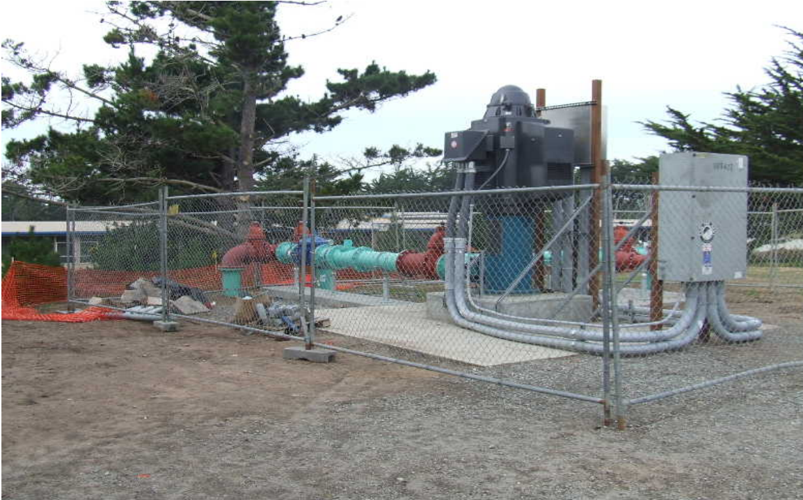
Figure 3. ASR Test Well, Seaside Middle School, November 2011.