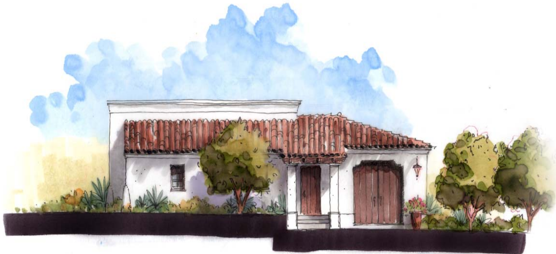
Figure 7. Design of Santa Margarita ASR site facility building approved by Seaside Board of Architectural Review.