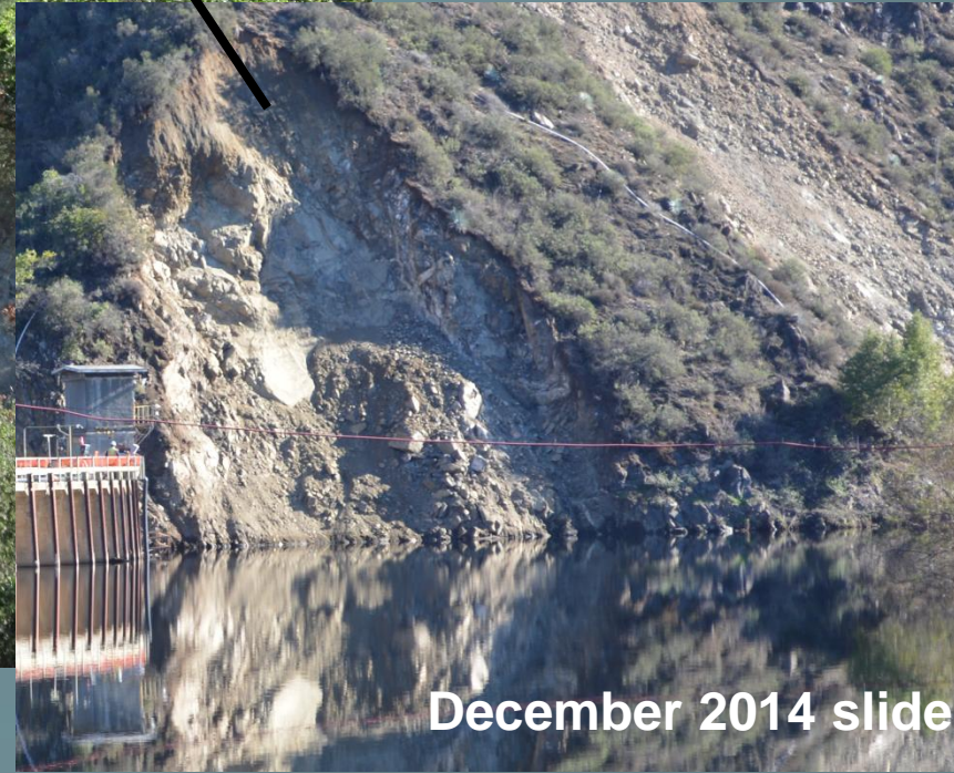
December 2014 slide