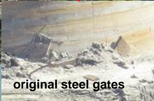
original steel gates