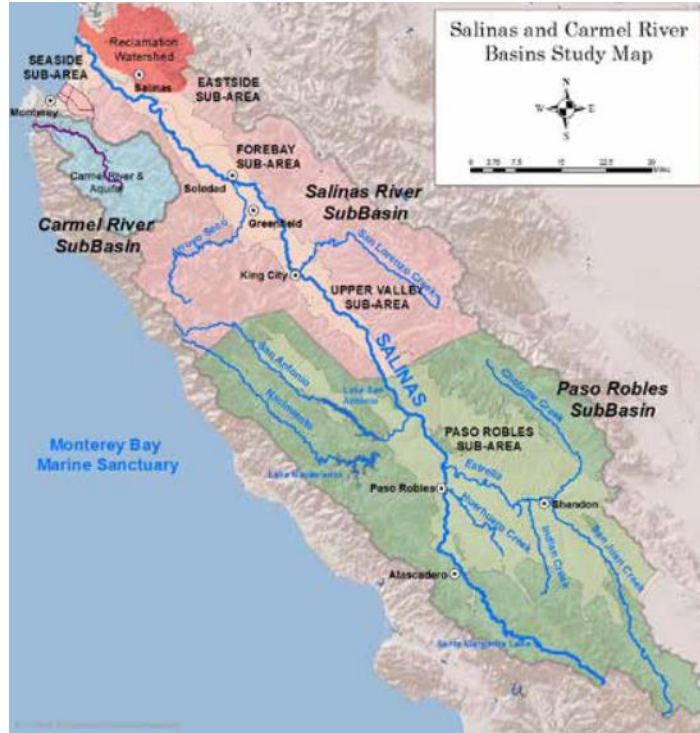
Figure 2 Basin Study Plan Area