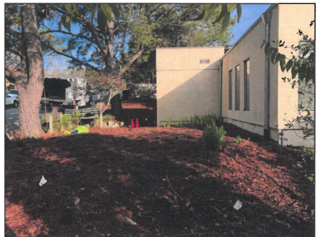
Project location viewed from the roof of the Public Works Department and from the south side of the proposed rain garden location, looking north.