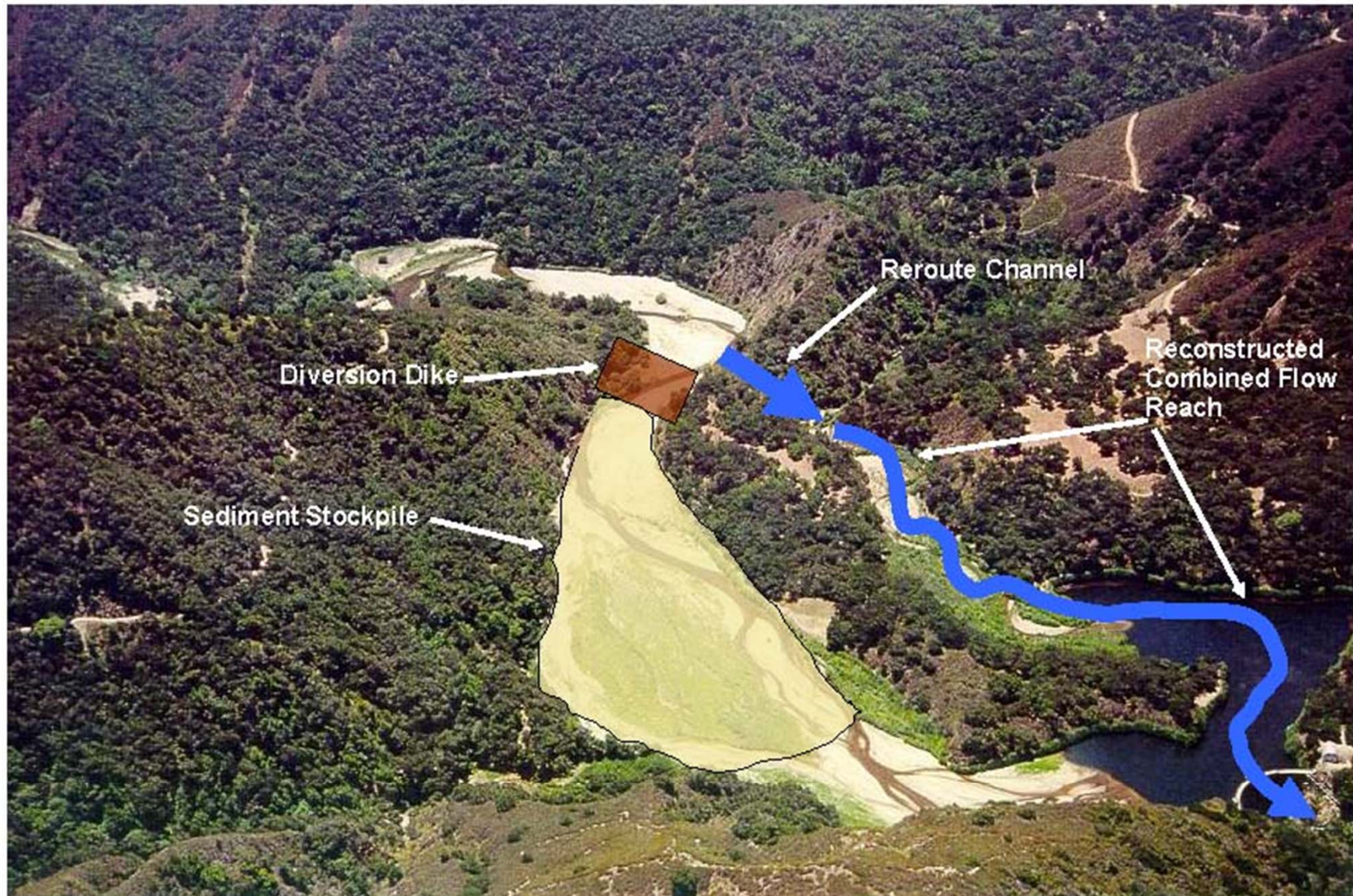
Aerial View of the Proposed Design for the San Clemente Dam Removal and River Reroute Project (SCD R&RR)